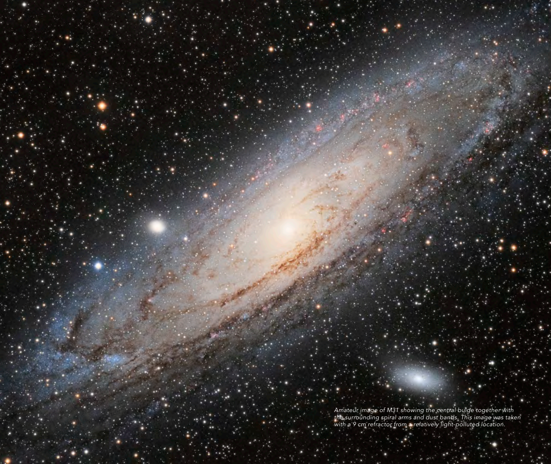
Amateur image of M31 showing the central bulge together with the surrounding spiral arms and dust bands. This image was taken with a 9 cm refractor from a relatively light-polluted location.