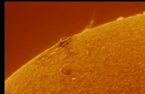
A solar outburst as seen by an Earthbound amateur solar telescope (Lunt 60mm) in the H-alpha band.

surface cools down to about 4000 Kelvin and sunspots form. These are darker spots because of their reduced radiation output. High points in the Sun's 11-year cycle coincide with high sunspot activity.