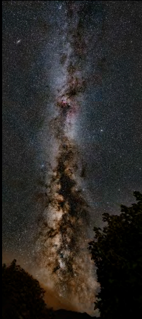
Milky Way as seen from a dark location in Austria. Here we have a view close to the center which is located just below the horizon in this view.

For decades, astronomers have been blind to what our galaxy really looks like. After all, we sit in the midst of it and can't step outside for a bird's-eye view.