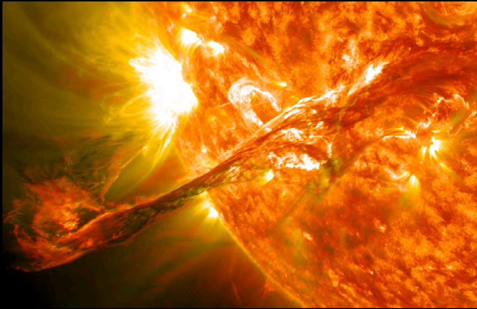
Solar prominence as seen by NASA's SDO satellite on August 31, 2012.

In the process of nuclear fusion hydrogen atoms are merging in several steps into helium atoms. Large amounts of mass are transferred into pure energy that is transferred to the surface of the Sun. The transfer of the energy from the core to the surface takes several thousands of years. In the central part the transport is performed via radiation that changes