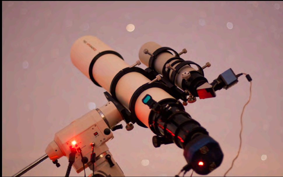
Modern amateur astrophotography setup using a cooled QSI CCD camera and computer guided mounting.

In this book, images from both professionals using state-of-the-art observatories on land and in space as well as amateur astronomers with more modest equipment are shown. The fast pace of development allows amateurs today to compete with