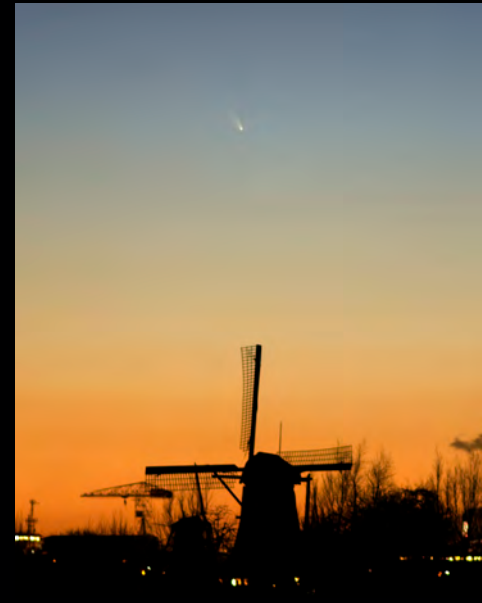
Comet 2011 L4 PanSTARRS over the world heritage windmills of Kinderdijk seen in March 2013.

This mission will follow the comet for an extended period of over a year during its perihelion passage around the Sun. The data Rosetta returns will detail the processes taking place during this closest approach.