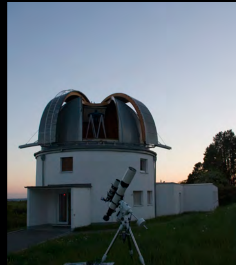
Professionals and amateurs join forces.

Keep in mind that this is just the start of the journey. The coming decades will reveal significant developments and we can only dream of what the future will bring us.