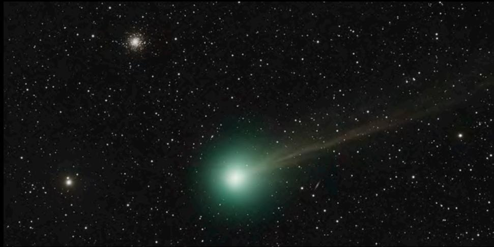
Image of comet C/2014 Q2 Lovejoy seen from Australia in December 2014. Left above of the comet is M79, a globular cluster in the constellation of Lepus. Just below the comet spiral galaxy NGC 1886 can be seen.

Comets are distinguished from asteroids by the presence of an extended, gravitationally unbound atmosphere surrounding their central nucleus. However, extinct comets that have passed close to the Sun many times have lost nearly all of their volatile ices and dust and may come to resemble